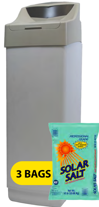
Part # CWTCM32WSALT